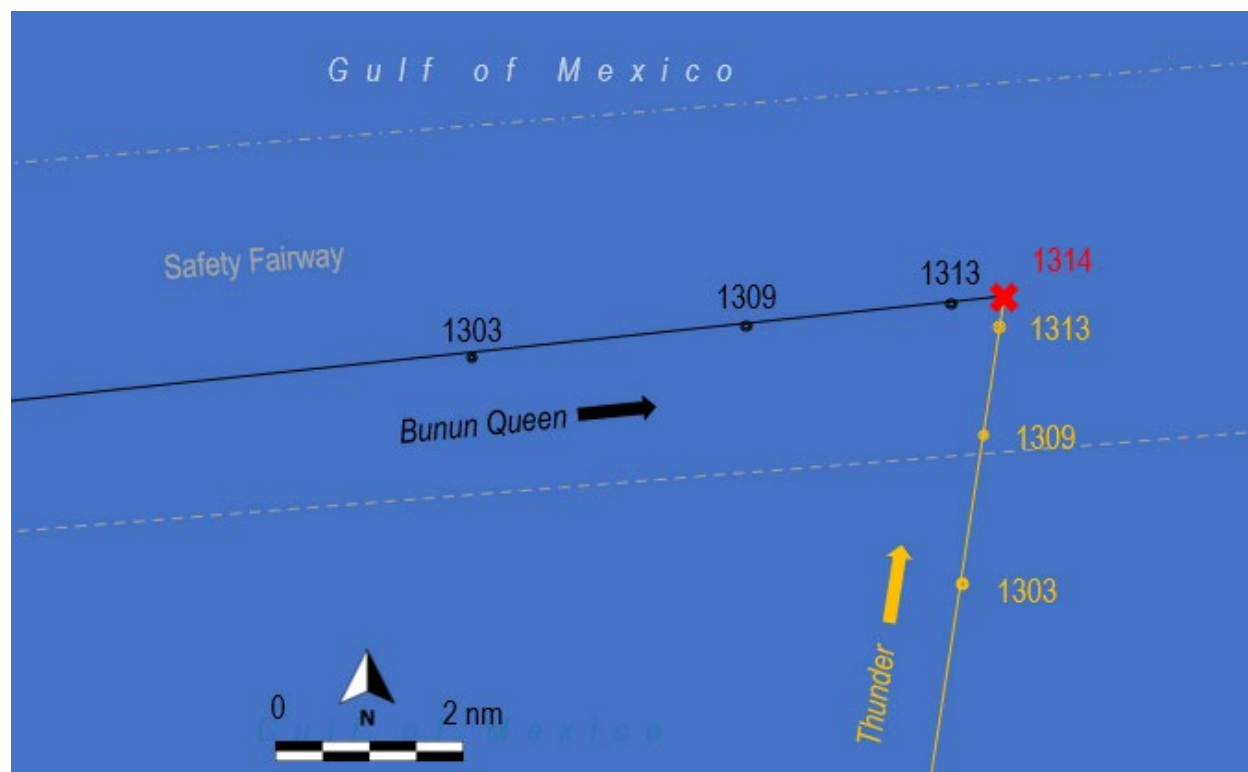
Figure 3. Tracklines of the Bunun Queen and Thunder leading up to the collision, based on VDR data.

“slight flicker” of the lights after the impact. Upon arriving on the bridge, he saw the master at the main console, and he went to the port side of the bridge where he saw the Bunun Queen ’s port side passing down the port side of the Thunder . He noted the impact caused the Thunder to heel to starboard, and water rushed over the main deck from the starboard side. The stern was pushed to starboard, making the bow go to port.