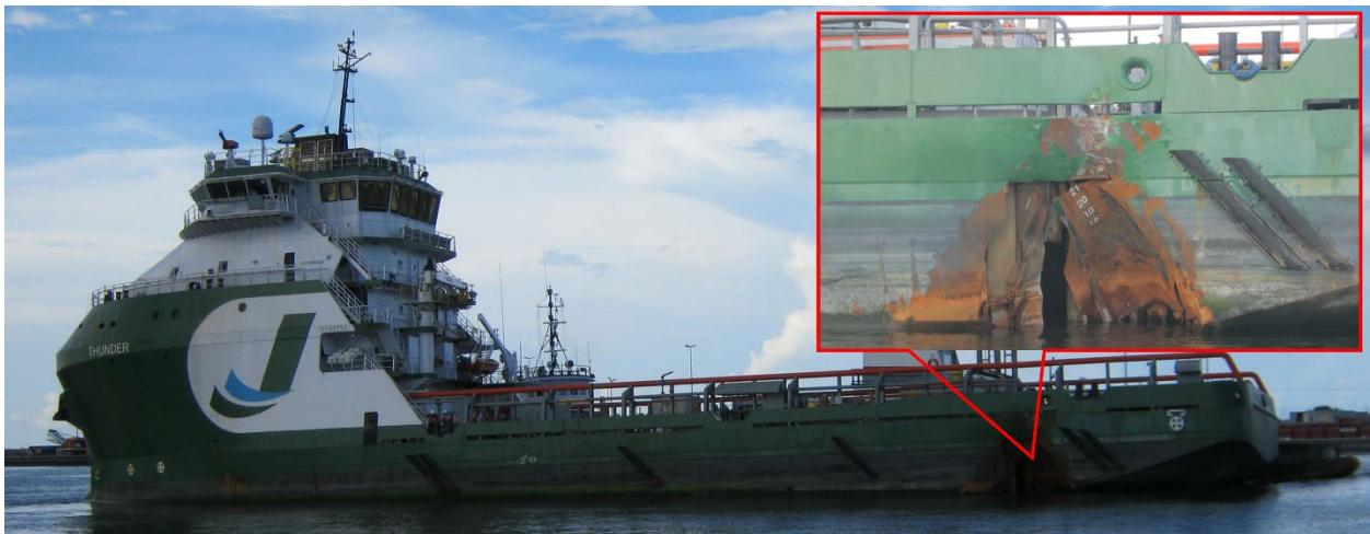
Figure 5. The Thunder being towed to a dock in Port Fourchon after the collision. The inset shows the damage to the aft port side of the vessel.

The Thunder sustained damage to its port side aft consisting of a large penetration above and below its waterline that caused flooding in the port side propulsion room, the port cargo tank (empty at the time), a void space, and the no. 7 port ballast tank. The cost of repairs was about $11,598,078.